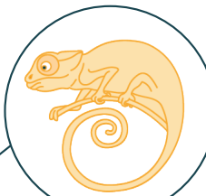
THE CHAMELEON OF GYNECOLOGY.

Endometriosis can strongly differ from case to case. That is why it is also called the chameleon of gynecology.